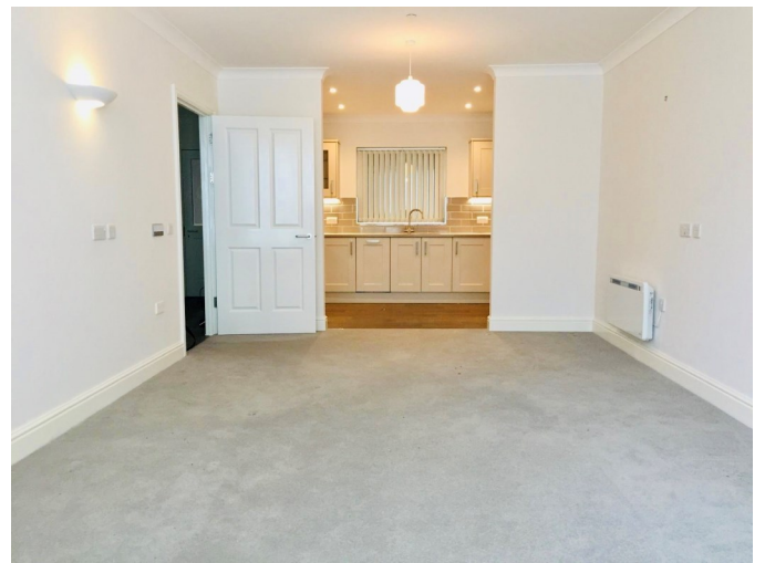
PHOTOGRAPHS FOR ILLUSTRATIVE PURPOSES ONLY